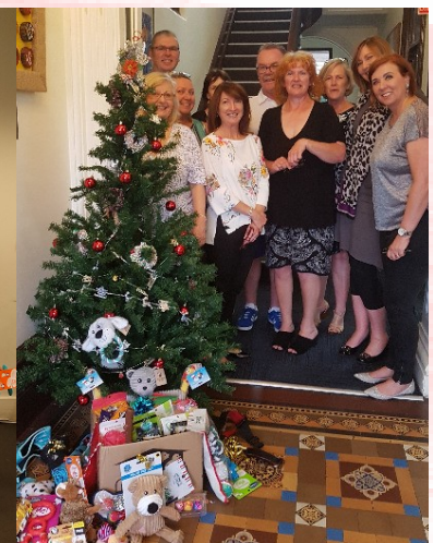
Dept of Education Arncliffe Office made a great donation