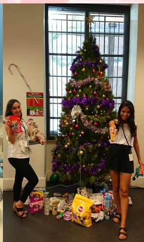
M & C Saatchi Collection, a big thanks to Phil