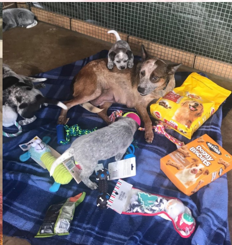
K9 Rescue recently took in a pregnant cattle dog named Cassie with a big litter of pups. The donations came at a very good time and were very much appreciated