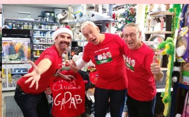
3 of the GADAB Crew at Edgecliff Pets