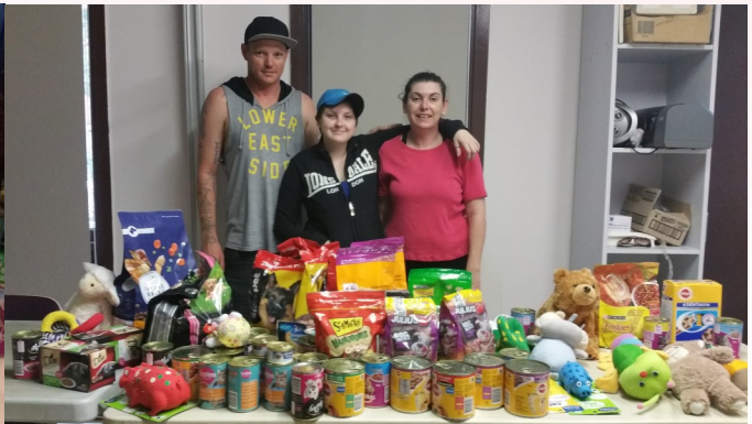
Northcott Community Centre receiving their donations