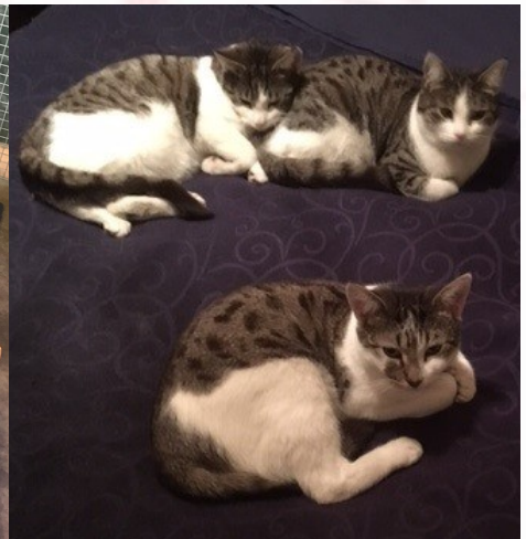
Rod & Andrew's 3 rescue cats