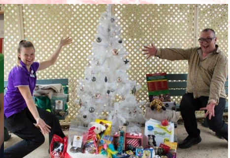
Casula Powerhouse Collection