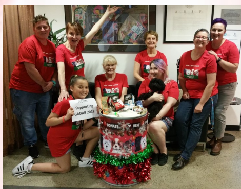
Some of the GADAB Crew